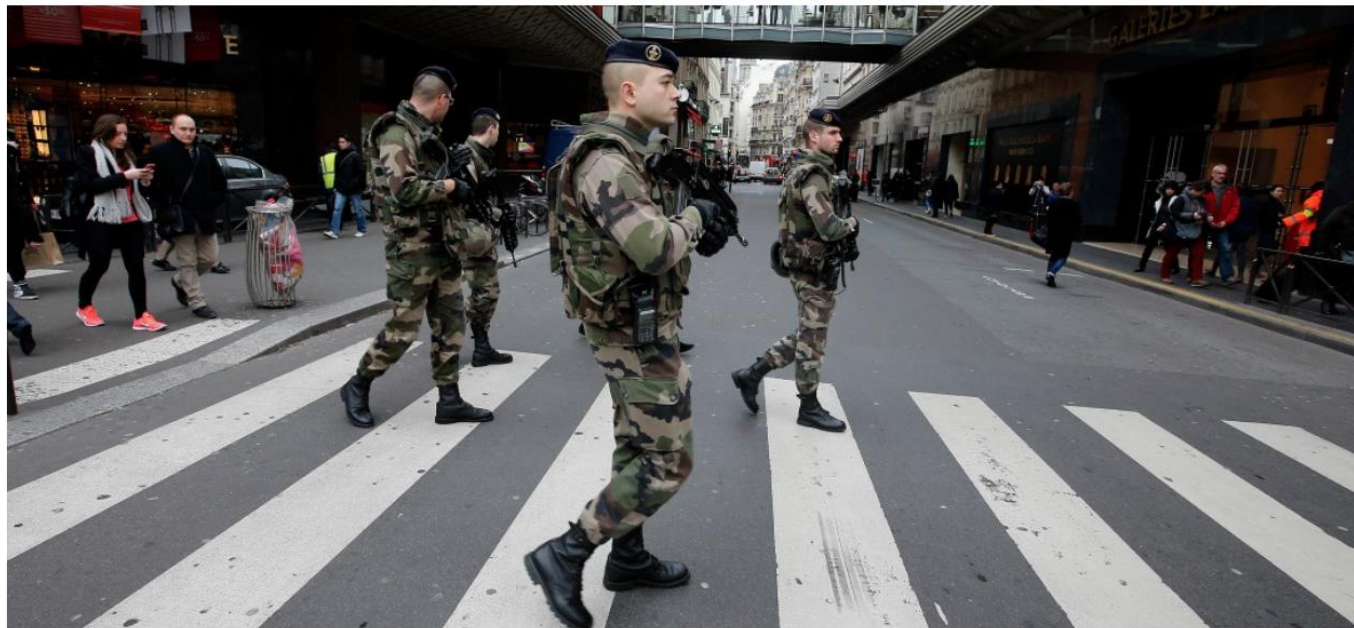
Des militaires français marchent dans les rues de Paris dans le cadre du plan Vigipirate, en janvier 2015.

Robin Panfili | France | 02.10.2015 - 10 h 45 | mis à jour le 02.10.2015 à 12 h 45